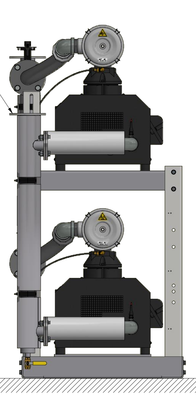
(RECEIVER REMOVED FOR CLARITY) -DRIP LEG VALVE (2 PLACES)