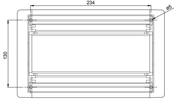
1st Fix Mounting Details