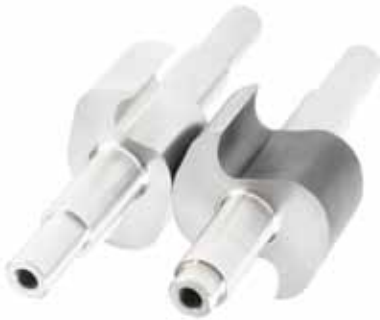
Z MED Double Tooth Element