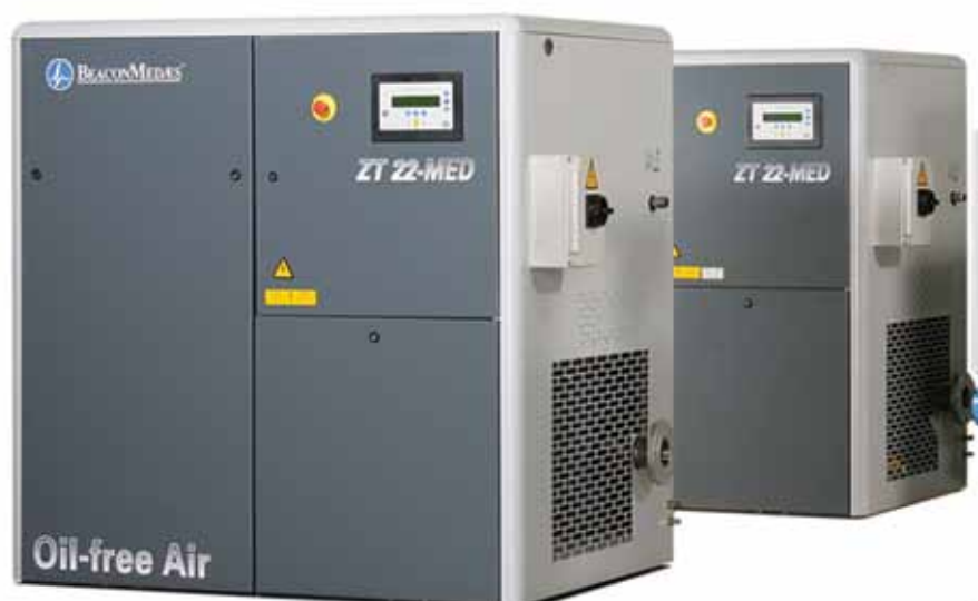
Triplex ZT22 MED shown